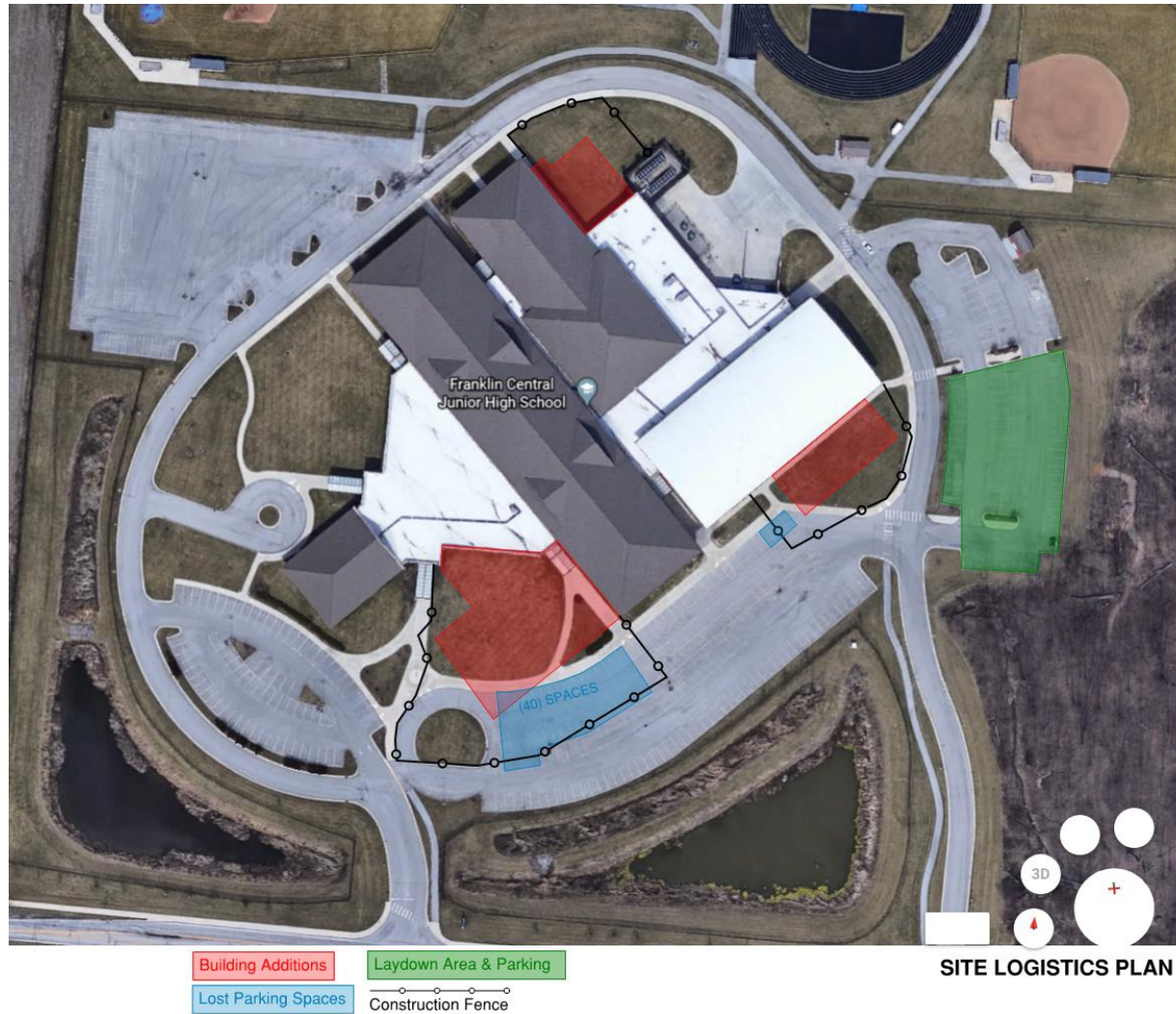
SITE LOGISTICS PLAN