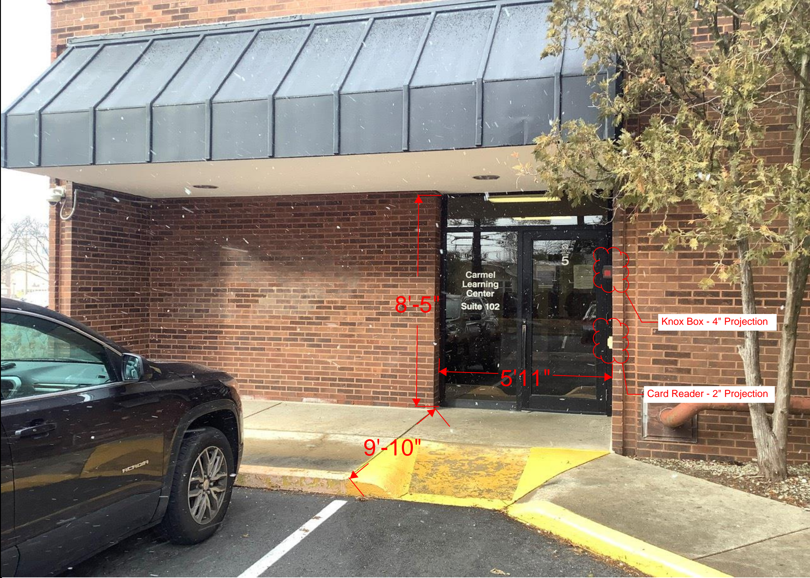
CARMEL LIFE AND LEARNING CENTER EXTERIOR ACCESS POINT – DOOR #5

The SKILLMAN Corporation Project Administration Construction Management