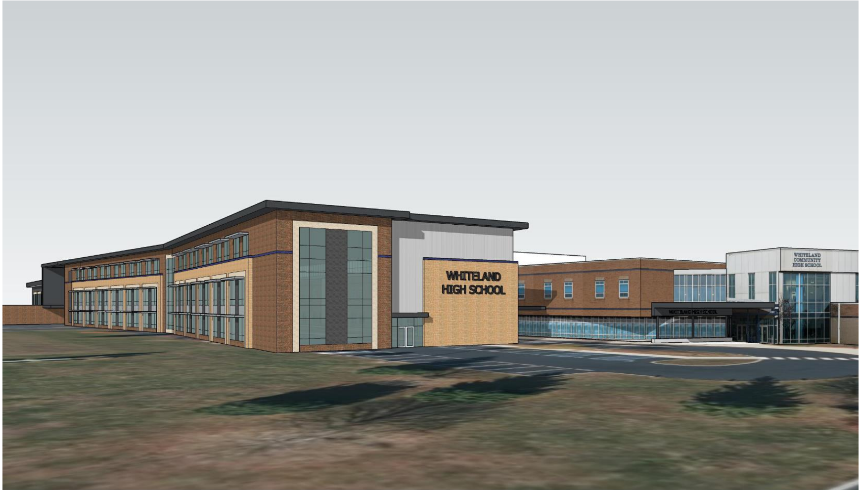
Whiteland Community High School Addition