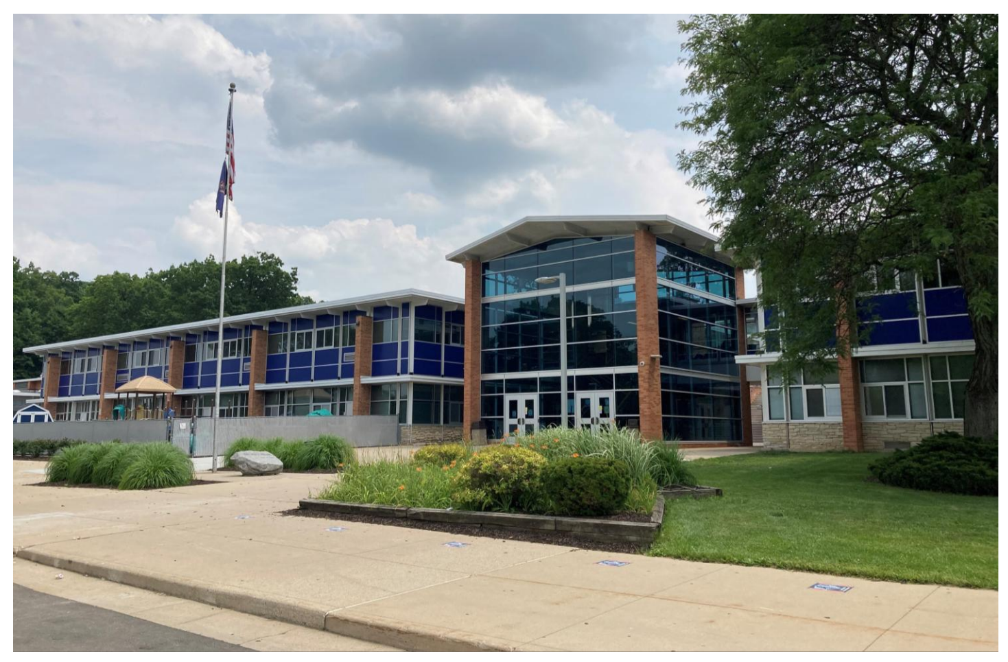
Loy Norrix High School Mechanical Improvements 606 East Kilgore Rd Kalamazoo, MI 49001